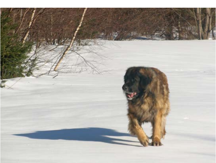
Arrakis in the snow